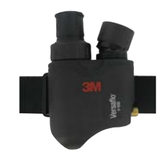
3M™ Versaflo™ V-500 Supplied Air Regulator For further information please visit 3m.co.uk/speedglas