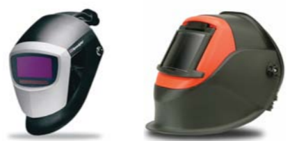
Other helmets and headtops in the Speedglas range From left: 3M™ Speedglas™ 9000 Series Welding Helmet and 3M™ HT-639 Welding Helmet For further information please visit 3m.co.uk/speedglas