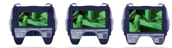
9100V 9100X 9100XX