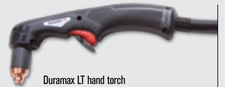
Duramax LT hand torch