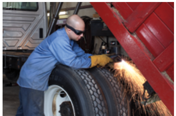
Vehicle repair and modification