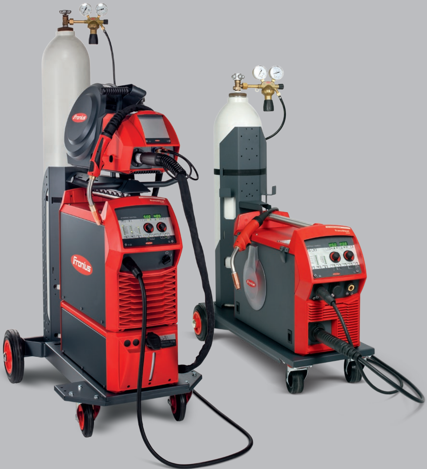
TRANSSTEEL 3500 SYN / TRANSSTEEL 5000 SYN